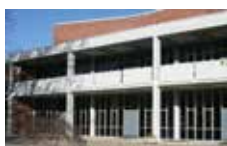
Playhouse Theatre, Theatre Building (near Palmer Museum of Art) University Park