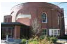
Pavilion Theatre Corner of Shortlidge and Curtin Rds. University Park