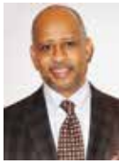
Playwright Ruben Santiago-Hudson

An Upper West Side dinner party invitation brings an unlikely group together, spawning a passionate and explosive debate on America's relationship to race. Tony Award-winner Ruben Santiago-Hudson brings humor and poignancy to one of the most potent conversations in American life. In our shared history, we all sing the blues. But are your blues sweet like mine?