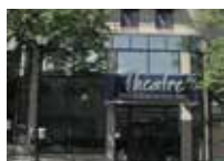
Penn State Downtown Theatre Center, 146 S. Allen St., State College